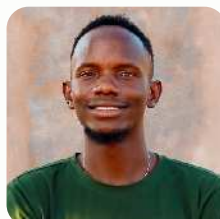
REGARN HOPE HOUSE OF HOPE OPERATIONS MANAGER / MEDIA